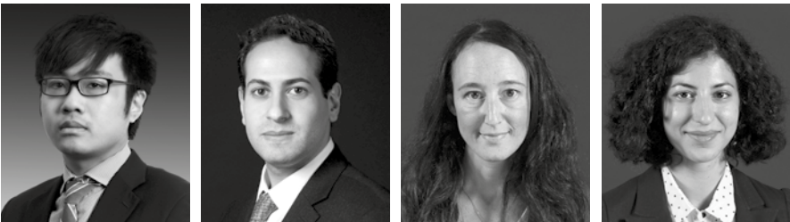
Sing Yan Choy London, New Bond Street